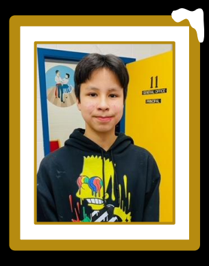
Perfect Attendance 85%+